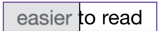
1000:1 contrast ratio

DarkChip3™ technology from Texas Instruments produces a stunning 3000:1 contrast ratio for pin sharp graphics and crystal clear text. Crisper whites, ultra-rich blacks makes images come alive and text easier to read - ideal for business and education presentations.